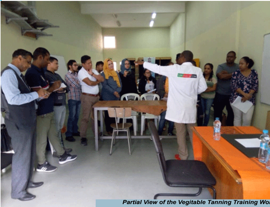
Partial View of the Vegetable Tanning Training Workshop