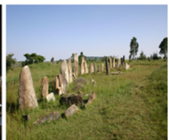
World Heritage Sites in Ethiopia