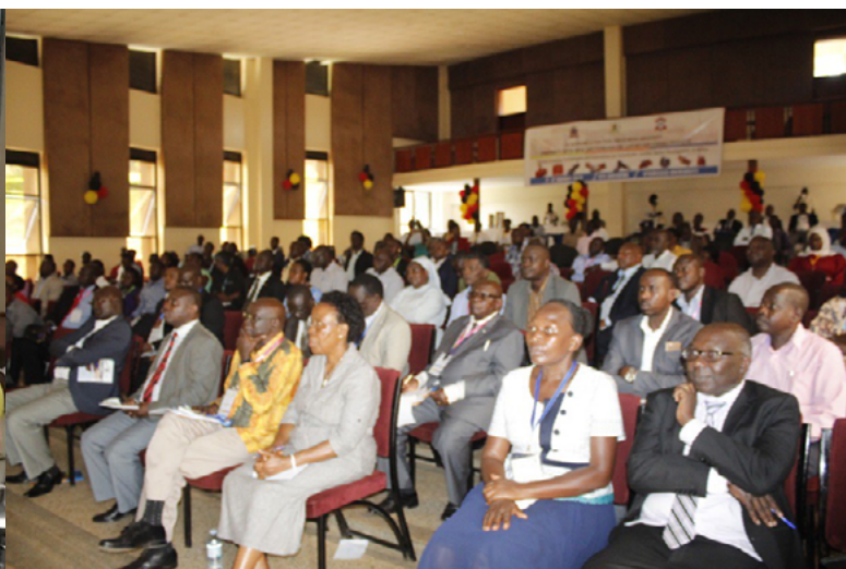
Partial View of the APSIC Conference Participants

Kyambogo University in collaboration with Ministry of Trade, Industry and Cooperatives Uganda, and Africa Leather and Leather Products Institute (ALLPI) organized the first Academic and Practical Skills Inter-university conference and Exhibition for Leather and Leather Products from 7th to 9th August 2019, in Kampala Uganda.