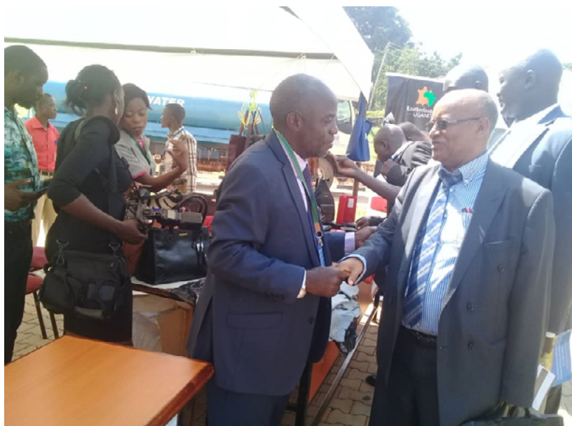
Conference participants visiting the leather Exhibition

promotion of the leather sector in Africa. It was attended by more than 100 participants representing academic institutions, different government ministries, enterprises and other stakeholders along the leather value chain.