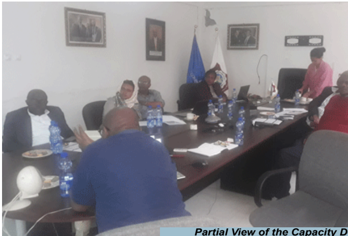
Partial View of the Capacity Development Training Workshop