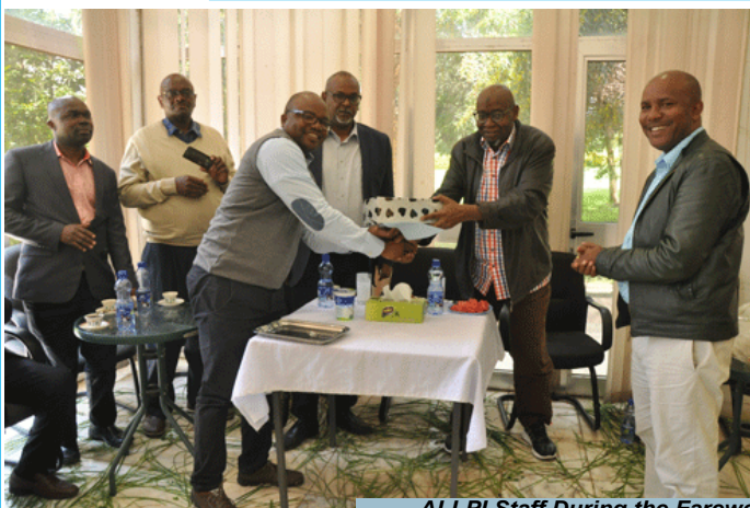
ALLPI Staff During the Farewell Program at ALLPI Headquarter