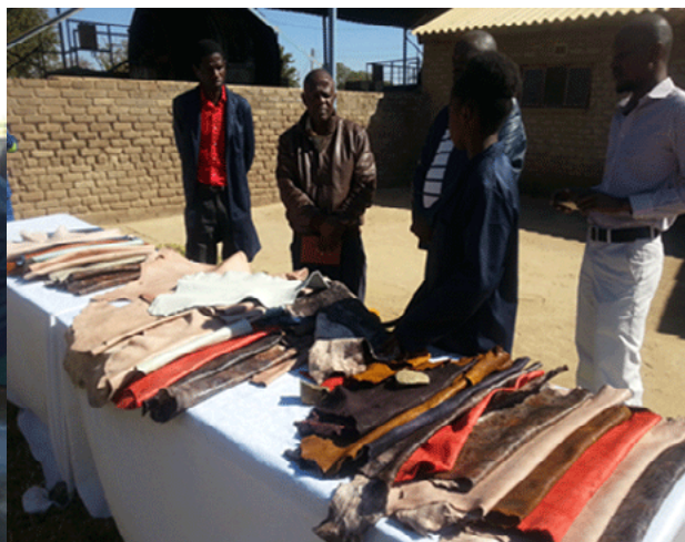
A display of the processed leather by the Trainees

Africa Leather and Leather Products Institute (ALLPI), in collaboration with the Zimbabwe Ministry of Women Affairs, Small and Medium Enterprises Development conducted a ten (10) day training on Vegetable (plant based) tanning at Artisanal/MSMEs at Kadoma in Zimbabwe.