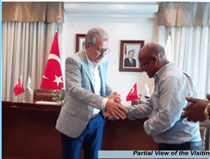
Partial View of the Visiting Team activities in Turkey