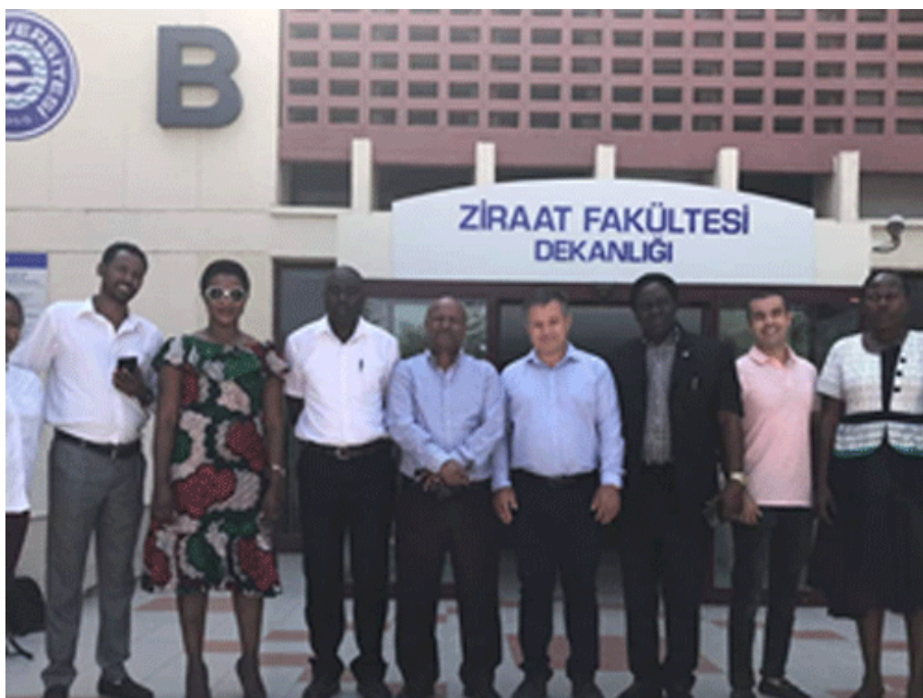
Partial view of the visiting team to Turkey