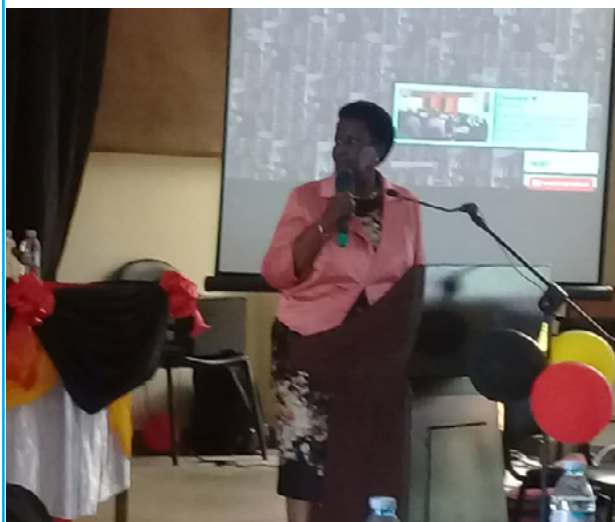
Hon. Amelia Kyambadde, Minister of Trade Industry and Cooperatives of Uganda