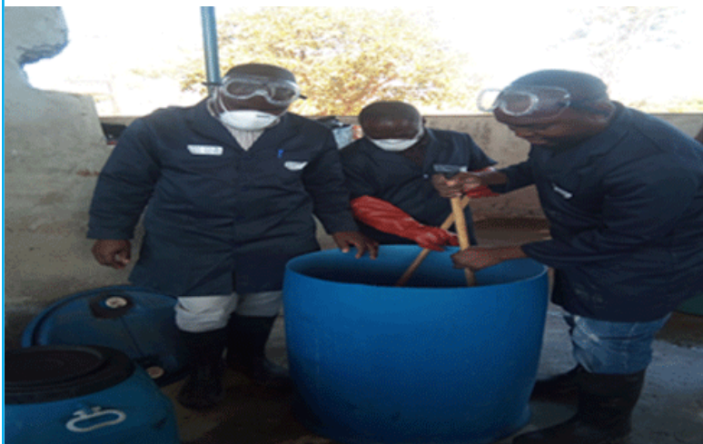
Trainees in action by increasing the mechanical agitation to speed up the reaction