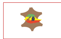
Ethiopia Leather Industry Association