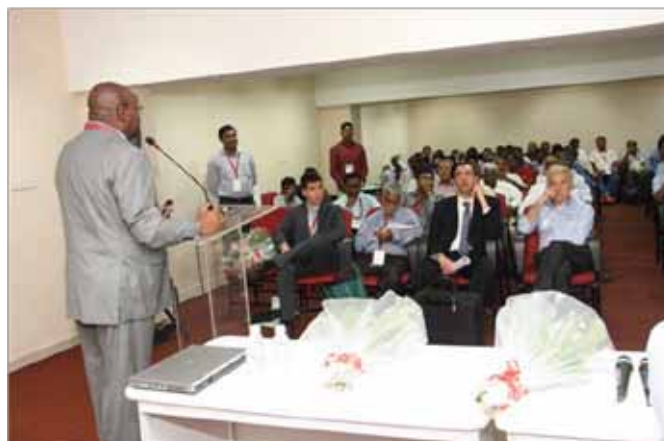
Executive Director, presenting a paper entitled "Status of Africa's Leather Sector – Challenges and Opportunities"

Concurrent with the exhibition, the Chennai Institute of Leather Technology Alumni Association (CLTAA) organized Technical Seminar that was attended by more than 200 leather sector enterprises and exhibitors. The Seminar was one of the main events of the Trade Fair in which the COMESA/LLPI's Executive Director, presented a paper entitled "Status of Africa's Leather Sector – Challenges and Opportunities". The Executive Director's presentation arose five interests among the Enterprises to visit COMESA countries for possible establishment of trade links and joint ventures. CLTAA and COMESA/LLPI agreed to work out a visit program for the Indian Leather Sector Enterprises to visit COMESA countries in 2015.