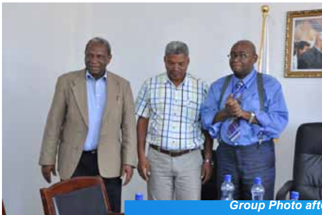
Group Photo after the Discussion

The discussion was concluded by pointing out areas of possible collaboration.