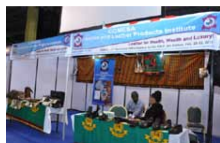
Partial View of the 8th Edition of AALF 2015 and Consultative Meeting