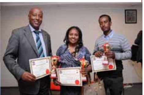
Partial View of the Consultative Meeting Event