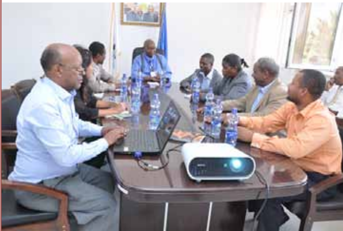
Delegates Discussing Common Issues with LLPI Experts Team

promote the development of the leather industry in Tanzania. As Tanzania is not a member of the COMESA it was agreed to initiate collaborative activities by signing an MoU or using the Tripartite Agreement. Members of the Delegation expressed strong interest and hoped to establish effective cooperation and fruitful partnership between COMESA/LLPI and Institutions/Organizations working in the leather sector in Tanzania.