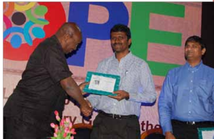
Memorabilia were presented to the LLPI delegates