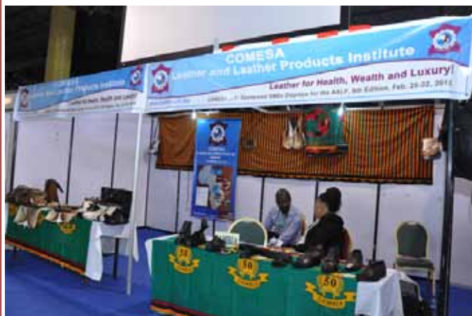
Partial View of the 8th Edition of AALF 2015