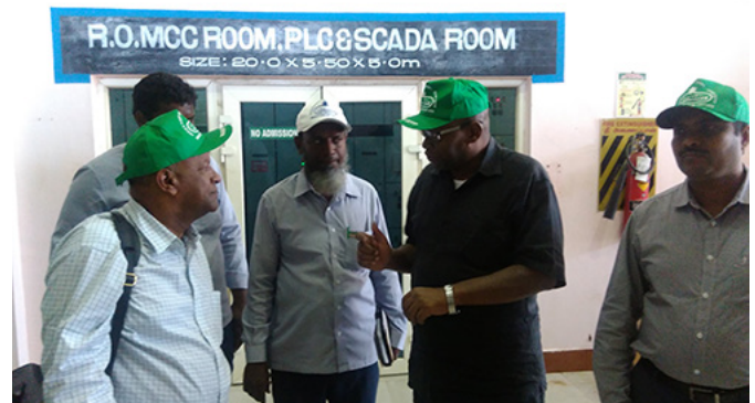
Partial View of the CETP Visit