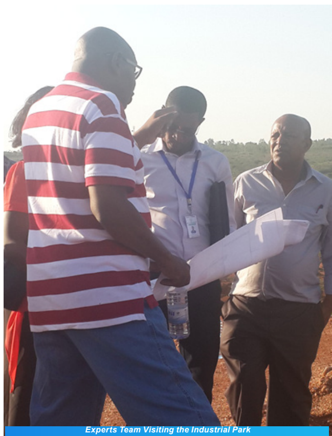
Experts Team Visiting the Industrial Park

His contribution in research and development activities in Africa and the whole world has paramount importance.