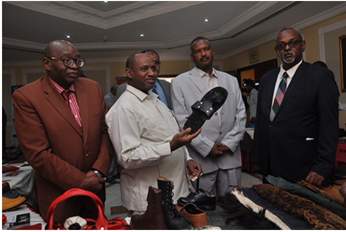
Guest of Honors Visiting the Mini Exhibition during the Forum

He then mentioned the natural resources that Sudan has in general and the abundance of sea natural resources along the coastline in Red Sea State in particular. The importance of Port-Sudan as gateway to Sudan and neighboring countries was also indicated. He said, Port Sudan is proud to host the event is that could serve as motivation to other states and indicated the signing