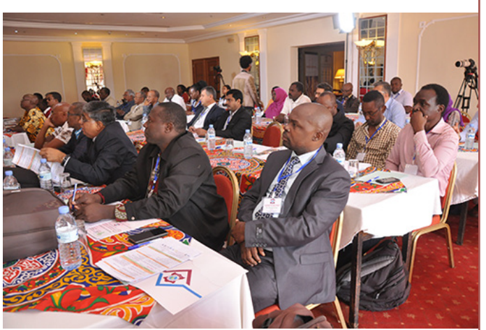
Partial View of the Opening Ceremony of the Forum

opportunity to host this important Forum and thanked ALLPI for choosing port-Sudan for the event. He made mention of other increasing number of international conferences being held in Port-Sudan. HE the Governor gave highlights on the tourism potential of the Red Sea state- state, rich heritage and resources including the rich marine resources along the coastal state and large