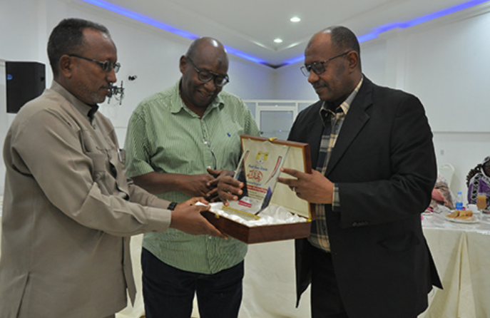
Lunch organized by the Red Sea State of Sudan and Recognition of the Executive Director of ALLPI