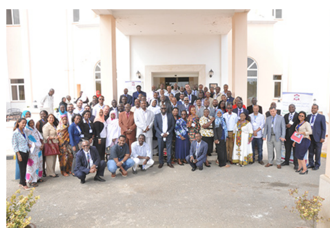
Group Photo of all Participants