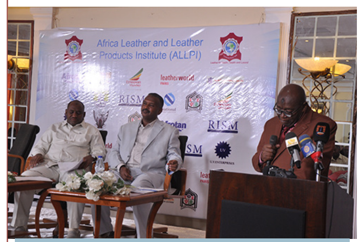
Partial View of the Opening Ceremony of the Forum

The opening event started with welcoming address,